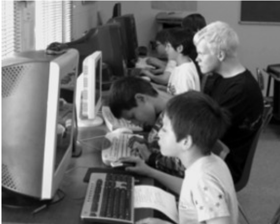
Donated computers at St. Maries Christian School

FREE GEEK is a 501(c)3 nonprofit community organization that reuses and ethically recycles technology to provide computers, education and job-skills training in exchange for community service.