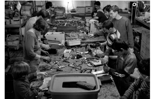
Adoption Volunteers deconstruct printers to recycle

The first step to getting plugged in at Free Geek is to take a tour. Approximately 30 minute tours are available 11 AM and 4 PM, Tuesday through Saturday.