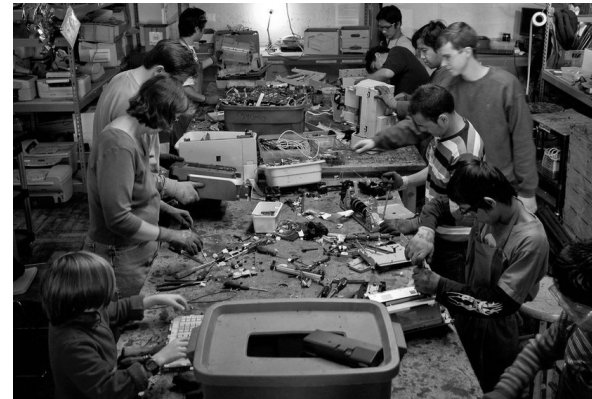
Adoption Volunteers deconstruct printers to recycle

The first step to getting plugged in at Free Geek is to take a tour. Approximately 30 minute tours are available 11 AM and 4 PM, Tuesday through Saturday.