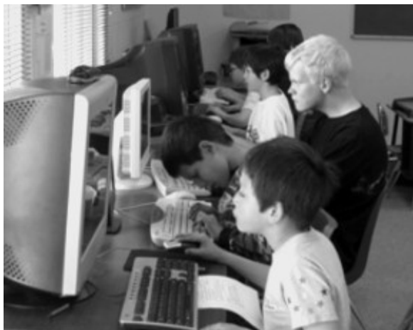
Donated computers at St. Maries Christian School

FREE GEEK is a 501(c)3 nonprofit community organization that reuses and ethically recycles technology to provide computers, education and job-skills training in exchange for community service.