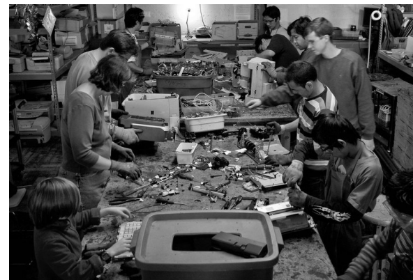
Adoption Volunteers deconstruct printers to recycle

The first step to getting plugged in at Free Geek is to take a tour. Approximately 30 minute tours are available 11 AM and 4 PM, Tuesday through Saturday.