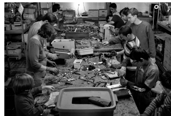
Adoption Volunteers deconstruct printers to recycle

The first step to getting plugged in at Free Geek is to take a tour. Approximately 30 minute tours are available 11 AM and 4 PM, Tuesday through Saturday.