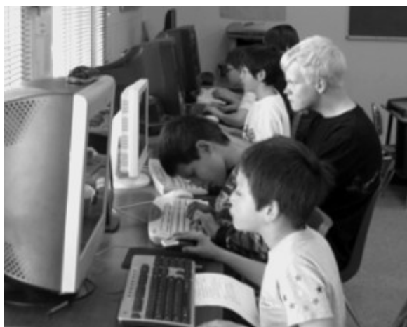
Donated computers at St. Maries Christian School

FREE GEEK is a 501(c)3 nonprofit community organization that reuses and ethically recycles technology to provide computers, education and job-skills training in exchange for community service.